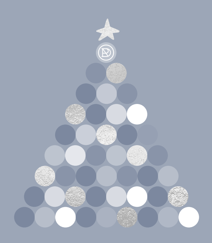
HETLAND HALL DUMFRIES